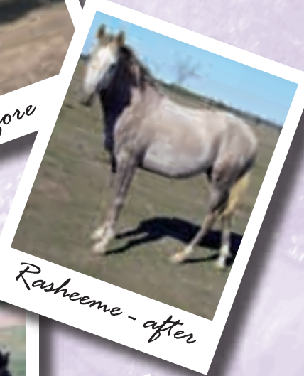
Rasheeme - after