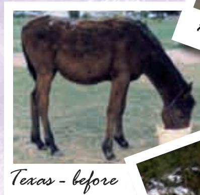
Texas - before