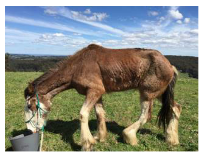
PH Ernie upon rescue

Here he is upon rescue, and here I am on him a couple of weeks ago: