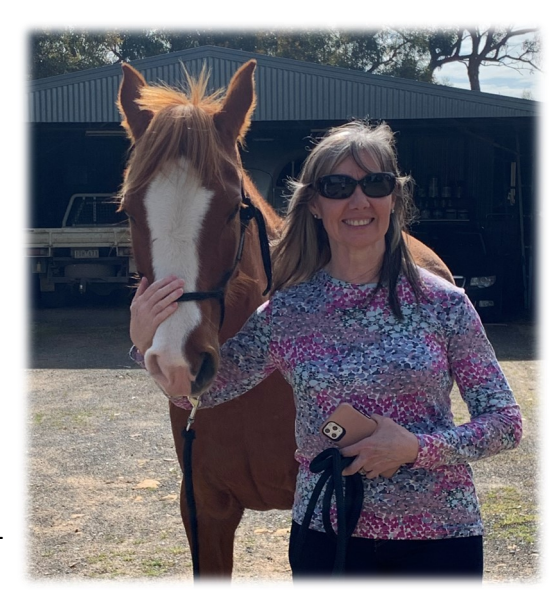
Getting acquainted with Project Hope Ava

I have a long time love of horses and have owned my own horses in the past for pleasure riding. Having spent a few years out of the saddle, I invested in some riding lessons to get back in touch with those skills and just to be around horses again. Thankfully, not all was lost during my absence and I'm loving riding again.