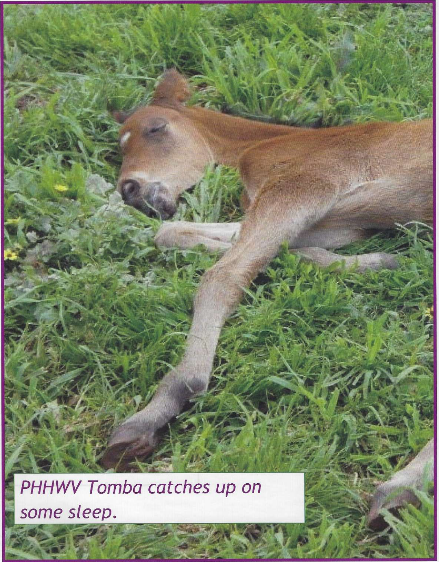
PHHWV Tomba catches up on some sleep.