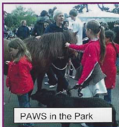
PAWS in the Park