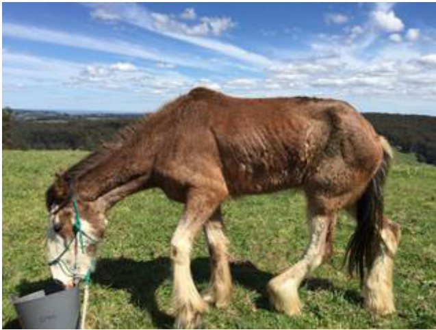
PH Ernie upon rescue

Here he is upon rescue, and here I am on him a couple of weeks ago: